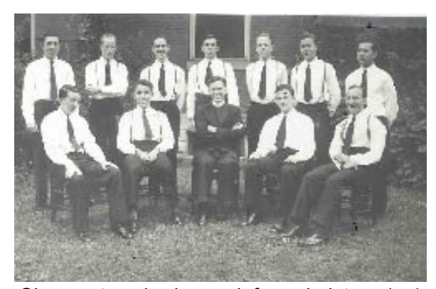
Classmates sharing an informal picture (up) and a more formal one (below)!