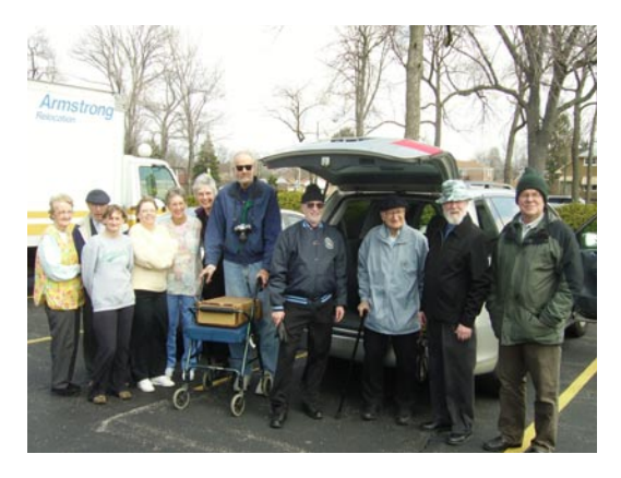
"Moving Day" for the men to Louisville. April 3, 2009.