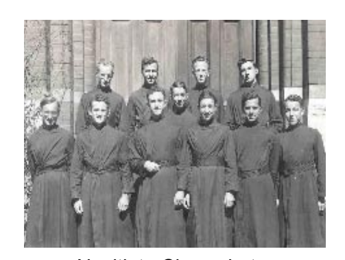
Novitiate Class photo.